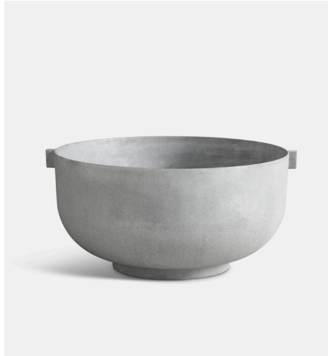
4030-01 / SMALL BLACK 4030-02 / SMALL RAW