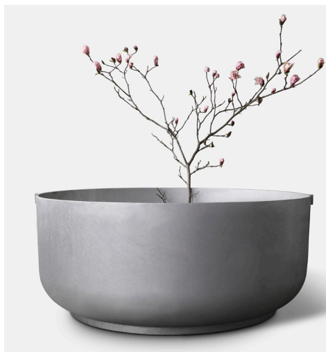
4050-01 / LARGE BLACK 4050-02 / LARGE RAW