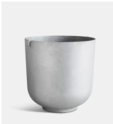
4060-01 / MEDIUM BLACK 4060-02 / MEDIUM RAW